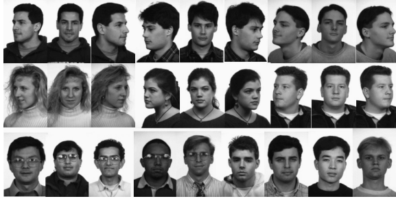
Fig. 1. FERET Sample images

(recall large edge values imply large asymptotic margins [19]). Thus, a large number of iterations are required to build enough base classifiers to create a strong final classifier. In practice, a trade-off between the competing goals has to be made.